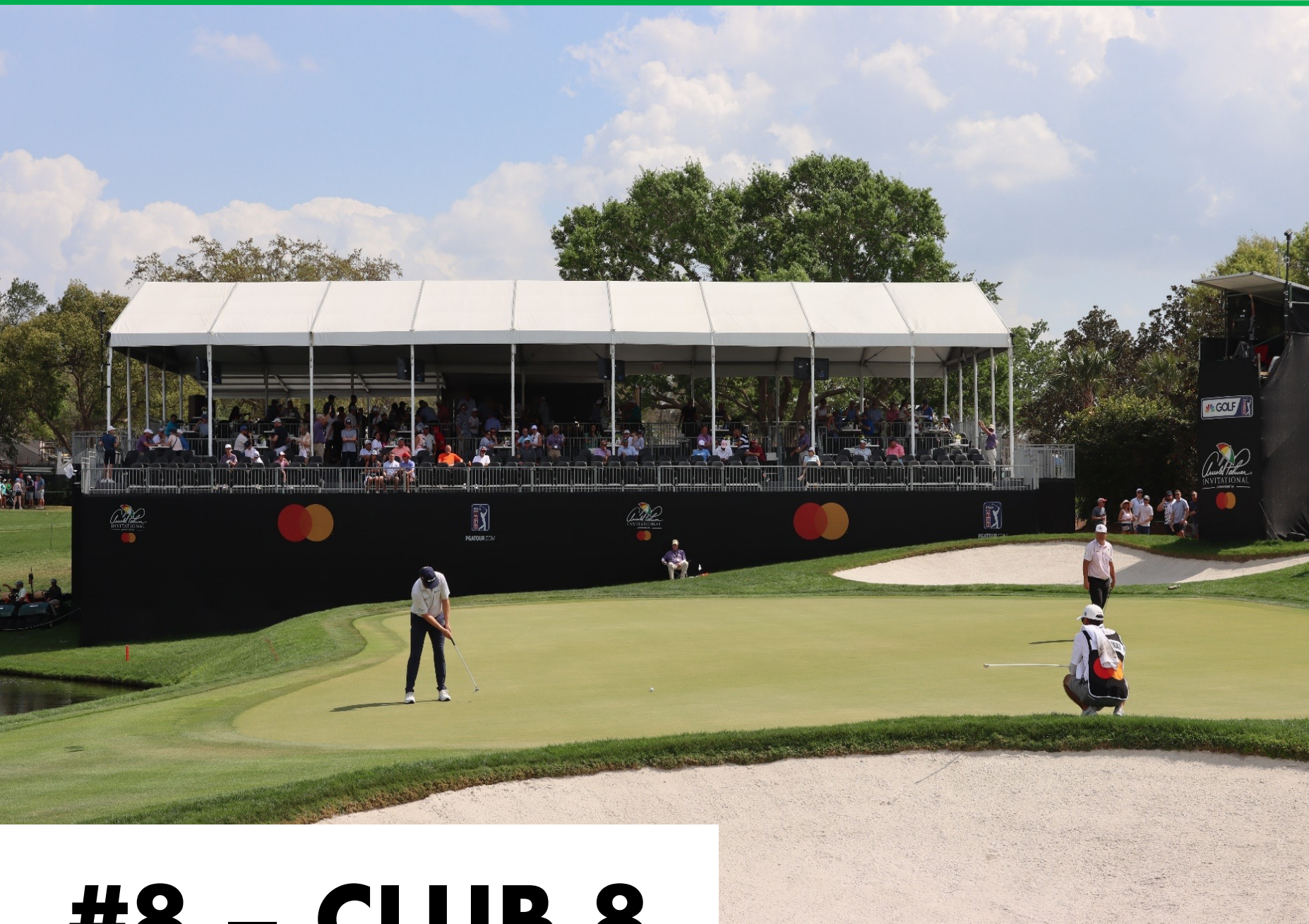
#8 – CLUB 8