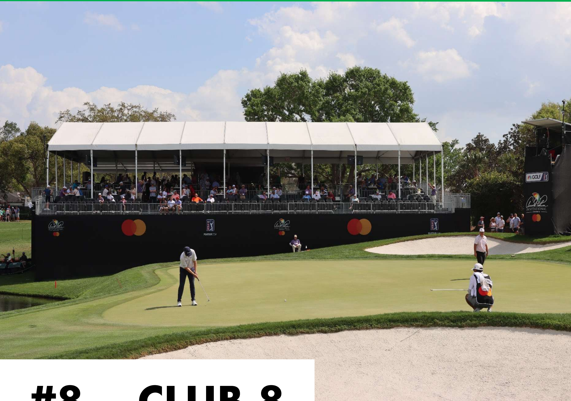
#8 - CLUB 8